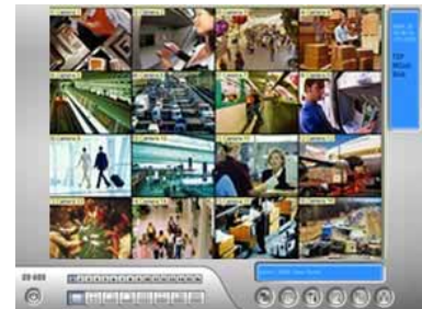
V Series Remote View