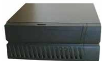
V Series DVR