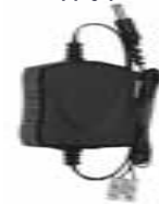
12 V Power Supply